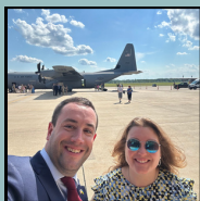
The Youngstown Air Reserve Station's 910th Airlift Wing welcomed the 1st C-130J Super Hercules Arrival.