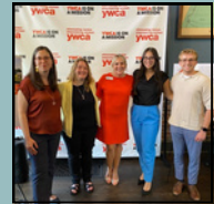
Team KO at the announcement of YWCA Van Wert County's Capital Campaign.