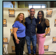
Thank you to Students Motivated by the Arts for the exceptional event.