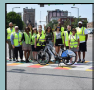
KO Consulting is proud to be a partner and supporter in keeping the East end of Federal St. safer