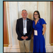
Our team spent the week at the Youngstown/Warren Regional Chamber's D.C. Fly-in!