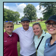
Team KO headed out to Alliance to support the YWCA of Alliance's annual golf outing.